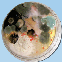
A/C coil mold growth before the UV360