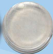
A/C coil mold growth after the UV360